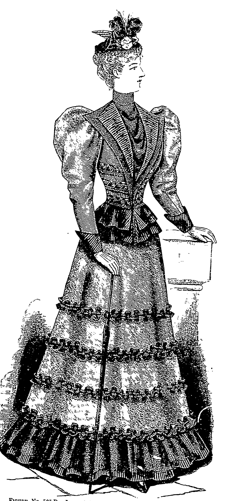
FIGURE NO. 505 D.-LADIES' COSTEME.-This illustrates Pattern No. 6617 (copyright), price 1s. 6d. or 35 cents. (For Description see Page 617.)

waist-line. It has fitted fronts arranged over dart-fitted lining-fronts, which are closed invisibly at the center. The fronts are stylishly reversed to the lower edge in tapering revers by a broad, fanciful collar,