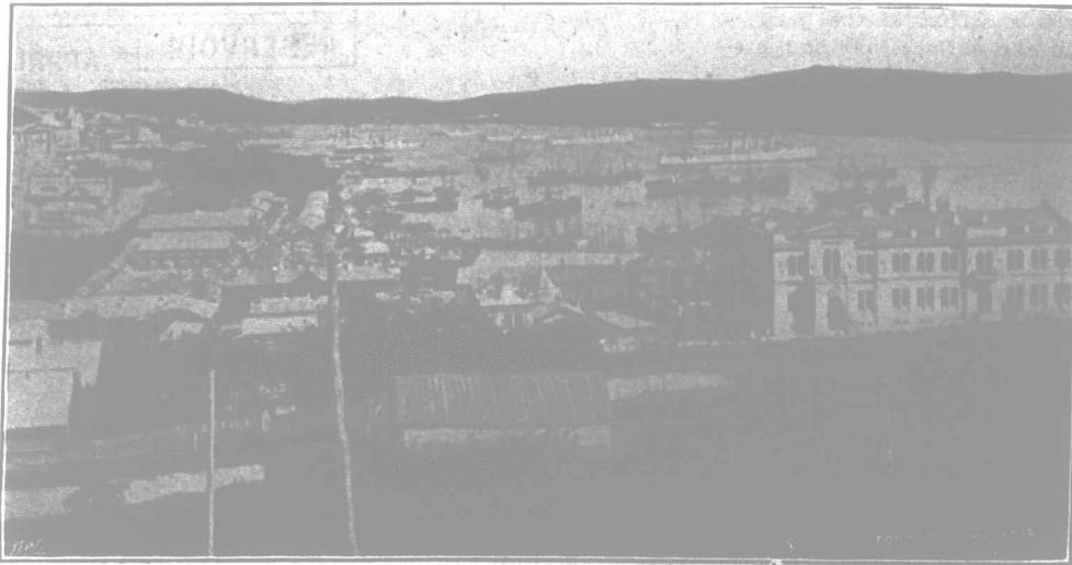
Vladivostock, the Eastern Terminus of the Trans-Siberian Railway.

The care and treatment that the sow intended for a breeder should receive while growing may be summed up in a few words: Keep her growing, but not fat, and give her ample room for exercise, on pasture in summer and in the barnyard in winter, and she should not be bred to have her first litter before she is a year old; better at fifteen or sixteen months.