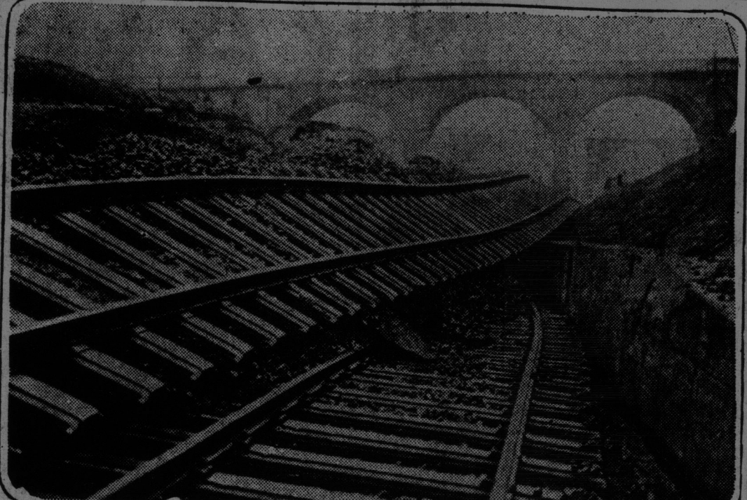
A landslide along the railroad between Berlin and Frankfurt, Germany, completely tied up service between those points for two days. An entire section of the track extending nearly a quarter of a mile slid down to another section of the rails, tying up traffic in both directions. Above is a view of the landslide.