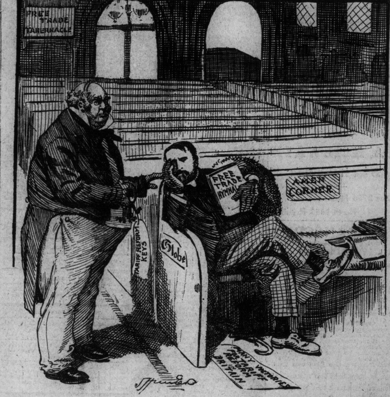
SEXTON BULL (Who Wishes to Lock Up): Beggin' of Your Pardon, Sir, But the Service is Hoover.