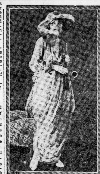
RUBY DE REMER, in "HIS TEMPORARY WIFE," W.W. HODGKINSON DISTRIBUTION AT THE PATRICIA TODAY AND SATURDAY.