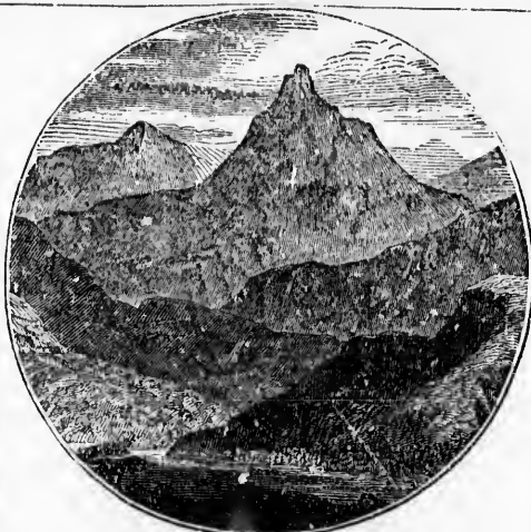
Here is a Picture of some Mountains.

What is a point of land which projects into the water called?