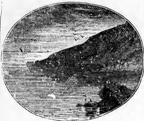
Here is a Picture of a Cape.

Pro-jects', Vol-ca'no, Moun'tain, La'va.