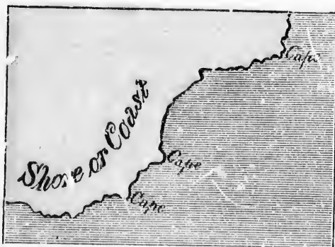
Here is a Map of a portion of some country, and on its coast you see three Capes.

A Cape is a point of land which projects into the water.