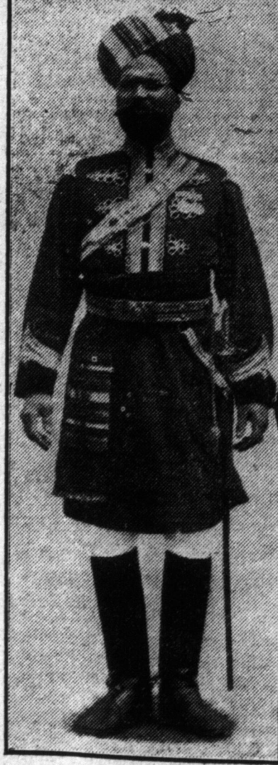
An East Indian cavalry officer.

IN HANDS OF RUSSIANS Two German Battalions Remain