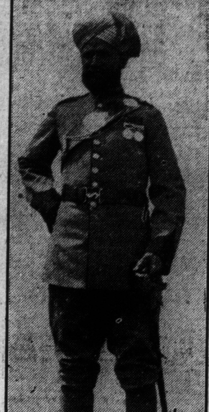
An East Indian infantry officer.