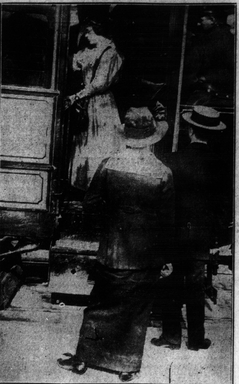
Women have taken the places of men in many lines of work in Paris. Photograph shows a woman working as a street car conductor.