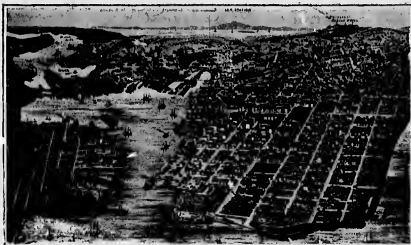
Bird's Eye View of St. John.

MANUFACTURERS cannot possibly find a better or cheaper means of introducing their goods to the public, or of keeping them before their notice, than by making an exhibit at these Exhibitions, which, without doubt, are always attended by the largest number of visitors that ever attend any Exhibition in the Maritime Provinces. Special Attractions of all kinds are the leading features of these Exhibitions. Correspondence is invited from all persons introducing novelties suitable for these purposes, as well as exhibitors in all classes.