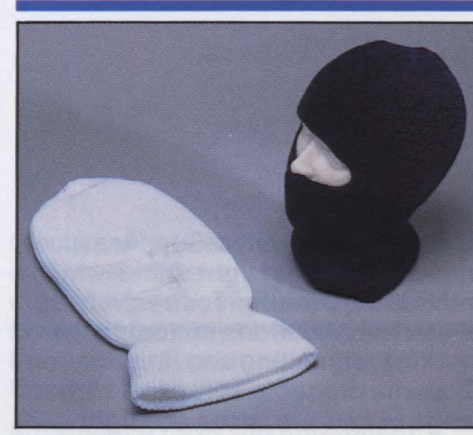
Three-hole and single-hole balaclavas for use in extreme cold weather.