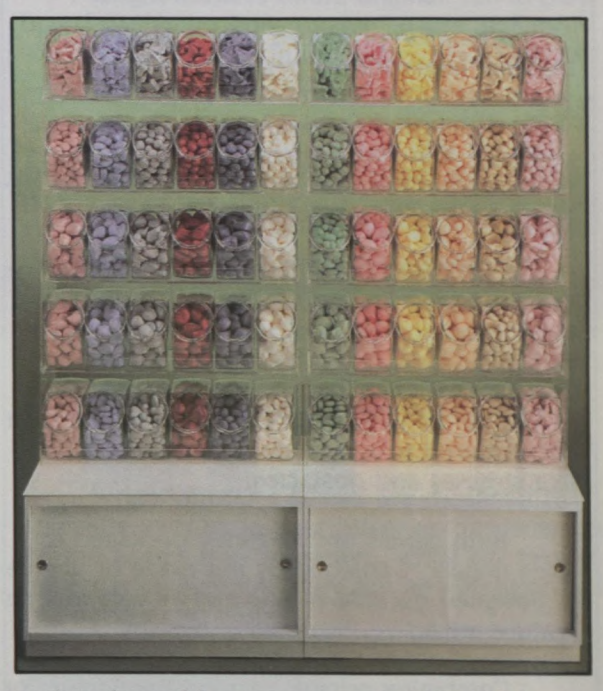
Multi-coloured hostess soaps feature the best selling shapes around the world today.

Operating from a new 75,000 square foot facility, Upper Canada has enjoyed an eightfold increase in sales since 1980. With a nation-wide sales force, we have earned the reputation as professionals who stress quality. Upper Canada's products are sold in gift stores, bath boutiques, craft stores and department stores at truly competitive prices.