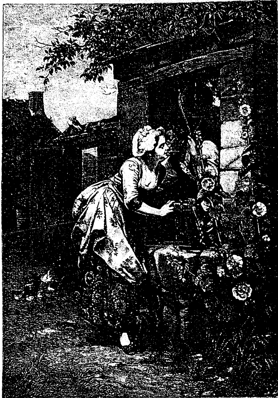
AT THE WELL.