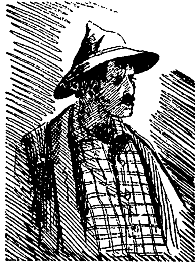
A TYPICAL NEW ORLEANS DAGO

The peculiar weapons of the New Orleans Mafia.