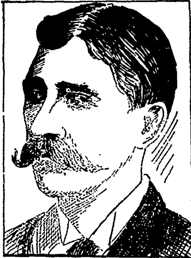
CHIEF OF POLICE HENNESSEY

WE GIVE several cuts illustrative of the New Orleans lynching, for which we are indebted to the Utica Globe .