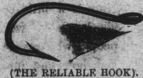
(THE RELIABLE HOOK.)

OF INTEREST TO FISHERMEN! 'ARTHUR JAMES' FISH-HOOKS.