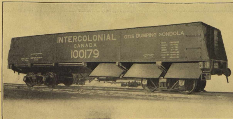
THE STANDARD COAL CAR ON CANADA'S LEADING RAILROADS.