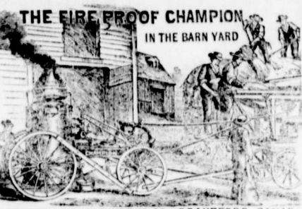
THE FIRE PROOF CHAMPION IN THE BARN YARD WATERLOUS ENGINE WORKS CO., BRANTFORD, CANADA

The Osservatore Romano publishes an encyclical, dated March 2, in which his Holiness Leo XIII. proclaims an outrage of ordinary justice, and the outrage of St. Joseph, to be held through the Catholic world, on the 19th of the present month until the 1st of November inclusive in Europe, and until the 31st of December in all places beyond the limits of this Continent.