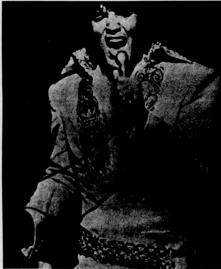
Elvis Presley can really rip into a crowd — hips and all.

Pop festivals became violent, unruly, unorganized arenas. They tried so hard to imitate Woodstock with its rain chant, when there was no rain; with its dope for sale signs; and with its gate-crashing. Toronto pop festivals were like that, and I assume that other North American festivals were like that too. The