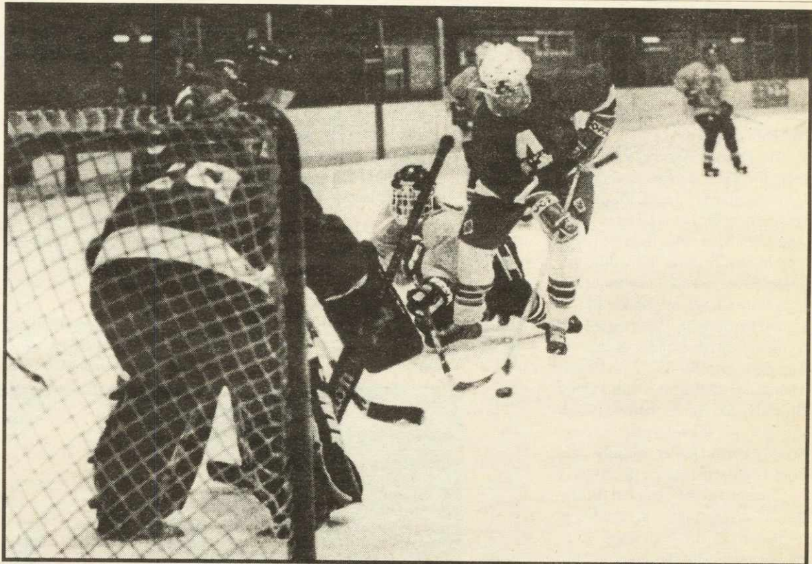
The Dalhousie women's hockey team failed to defend their Nova Scotia Women's Hockey League title this past weekend. They fell 3-1 to the Halifax Breakers in Sunday's final after defeating AUA Champions SMU in preliminary action. Please see next week's issue for the full story.