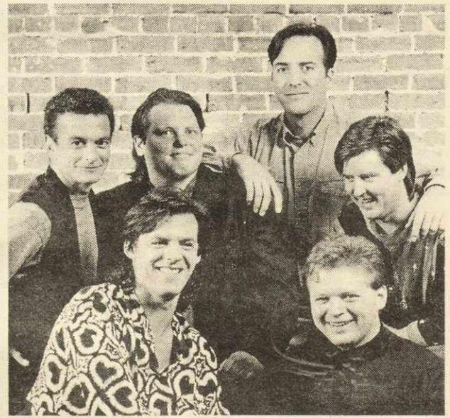
Friday, October 14, 1994

Show starts at 10:00 pm. Tickets $10 (taxes included). Available at all Sam the Record Man locations or at the door