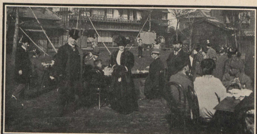
Entertained by the School Girls.