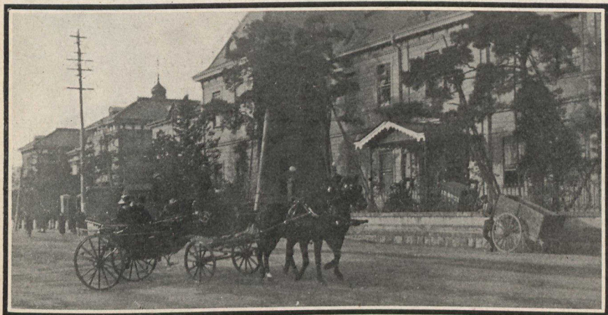
In Front of the Imperial Hotel, Tokio.