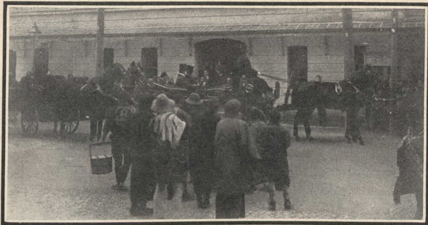
At the Post-office in Tokio.