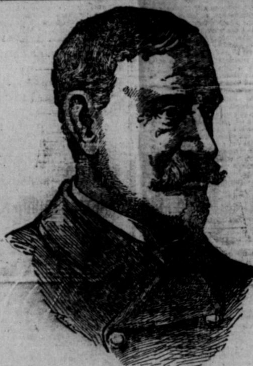
COMMODORE WINFIELD SCOTT SCHLEY. Head of the United States Flying Squadron.

Madrid, May 10.—A cable dispatch has been received here from the captain-general of Porto Rico, saying that three suspicious looking vessels are