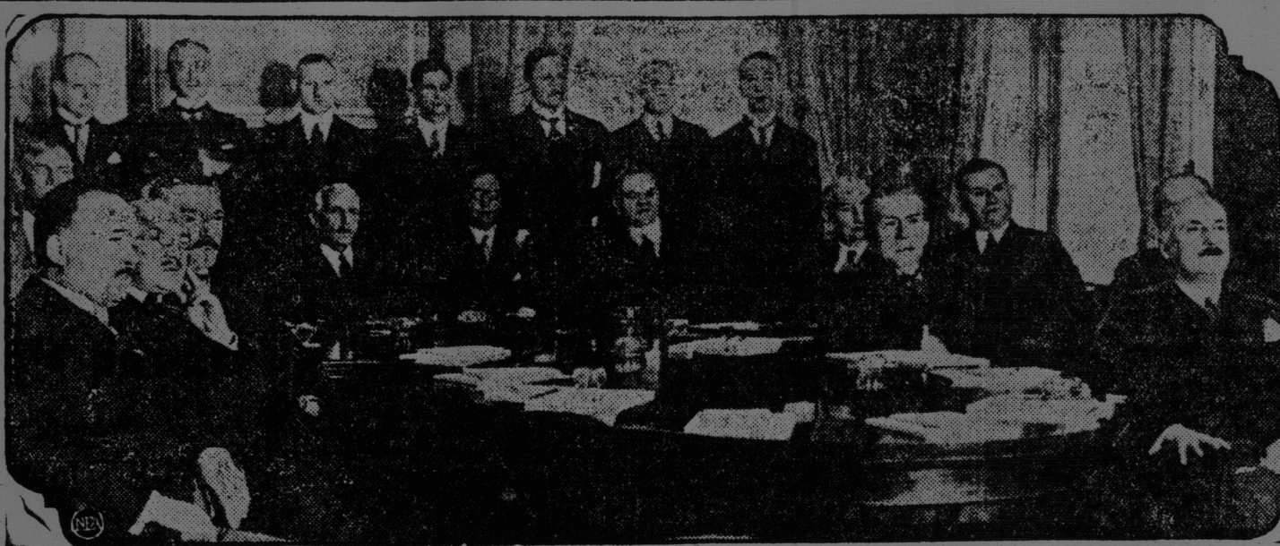
This shows the first meeting of the French debt commission with Secretary Mellon and his colleagues at Washington, when the French submitted a tentative proposal which Mellon found unacceptable. Mellon can be seen at the back, in the left centre, and Joseph Caillaux, French Finance Minister, is seated on the extreme right.

ter to the president of the Conservative Association.