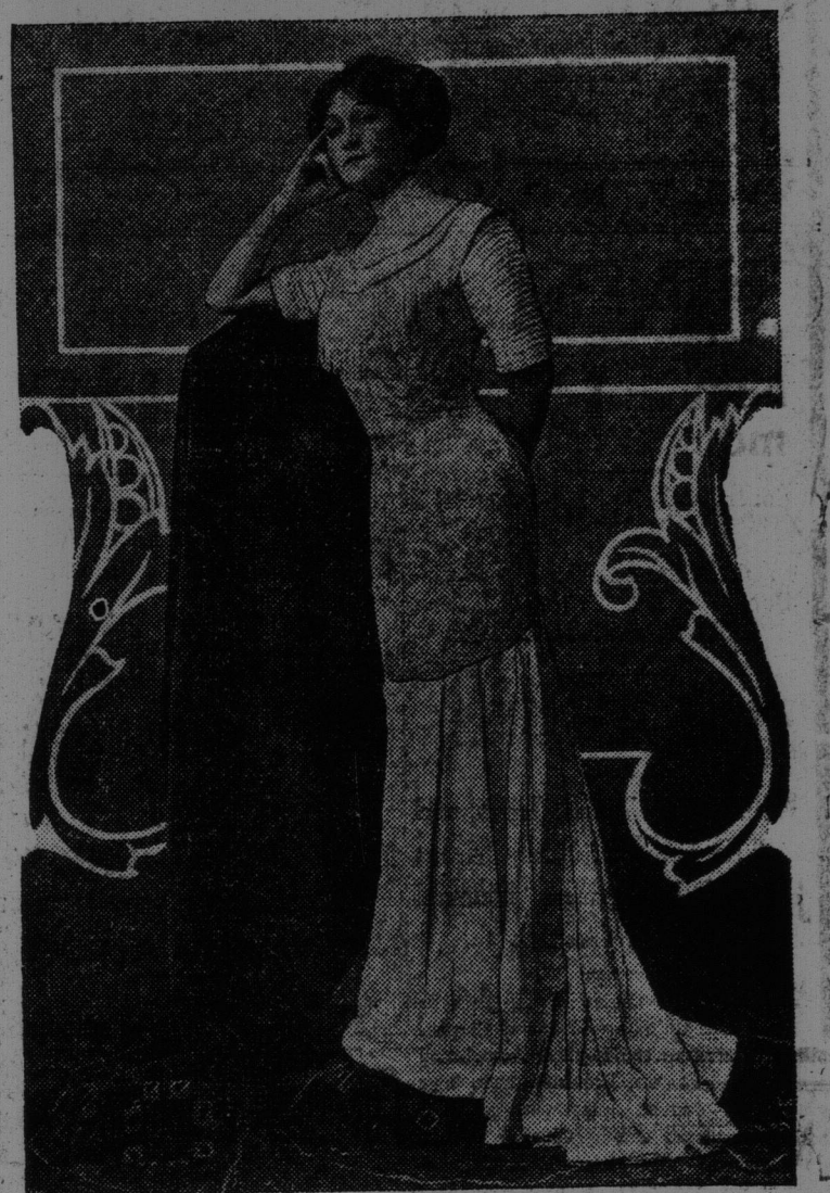
A CUIRASSE EMBROIDERED WITH PEARLS,