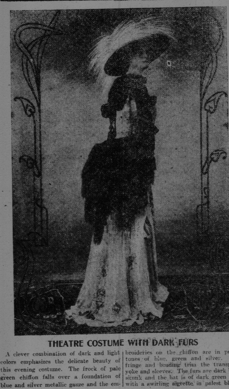
A clever combination of dark and light colors emphasizes the delicate beauty of this evening costume. The frock of pale green chiffon falls over a foundation of blue and silver metallic gauze and the em-