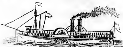
THE FINE IRON STEAMER

RIVER SAGUENAY, MURRAY BAY, RIVIERE-DU-LOUP, CACOUNA AND TADOUSSAC.