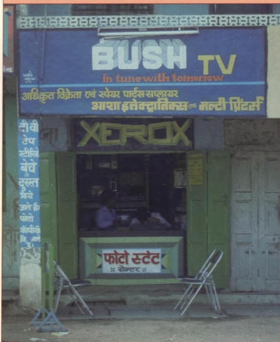
TV shop in India