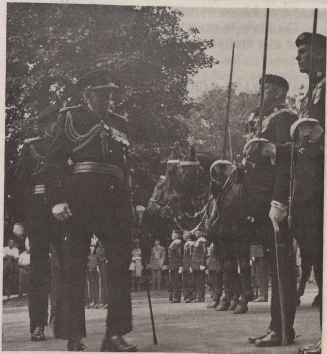
Former Governor-General Vanier inspects officers of the 8th Canadian Hussars at Rideau Hall in June 1966.