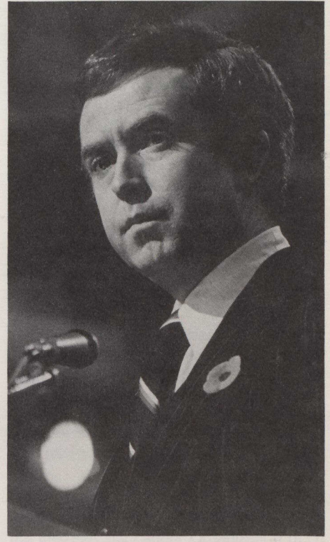
Secretary of State for External Affairs Joe Clark spoke at the General Assembly of the United Nations on September 25.

"Canada will continue its financial support of the World Disarmament Campaign. We shall, in addition, expect that the newly-