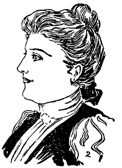
Dr. Coderre's Red Pills for Pale and Weak Women are a medicine for women and girls alone. It is not meant for men.

Have you ever noticed how quickly a woman loses her good looks and attractiveness? She will have a fair face, beautiful complexion and well-rounded figure.