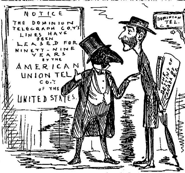
Mr. GRIP.—Happy thought! Suppose we lease the Dominion to the Yanks for ninety-nine years.