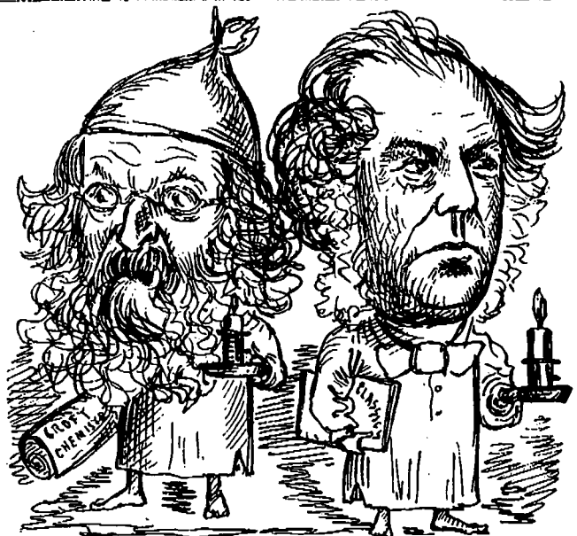
THE RETIRING PROFESSORS.