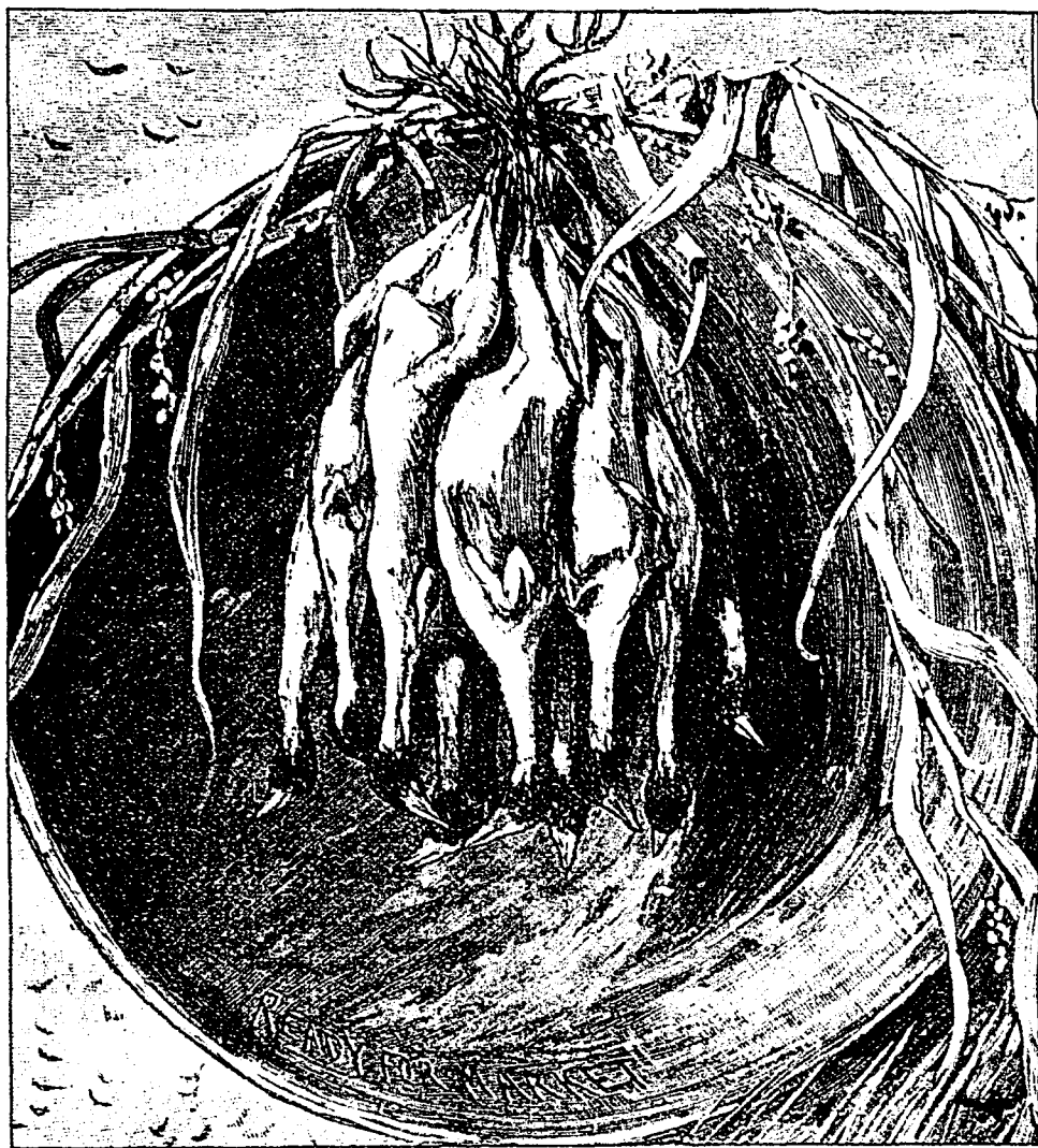
READY FOR MARKET.

Address, G. B. BURLAND, 5 & 7 Bleury Street, Montreal.