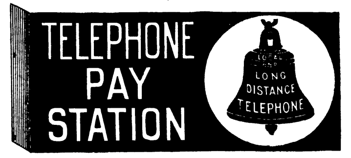
No. 5. Double, 19\frac{1}{2} \times 8 inches, including flange. If made single without flange, 18 \times 8 inches.