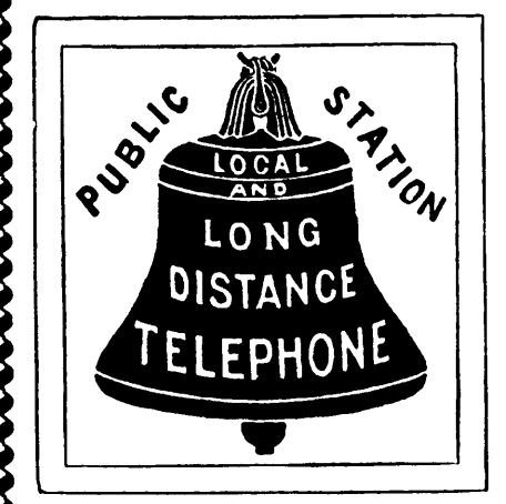
No. 1. Single, 17 x 18 inches. If made double with flange 18\frac{1}{2} x 18 inches.

Guaranteed Not to Fade or in any way to Perish from Exposure.