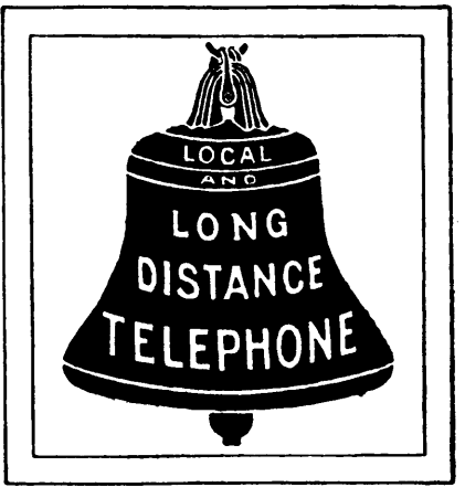
No. 2. Single, 17 x 18 inches. If made double, with flange, 18\frac{1}{2} x 18 inches.