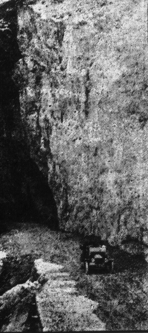
(1) Sinclair Pass, Highway of the Great Divide. (2) Sinclair Canyon, Highway of the Great Divide.