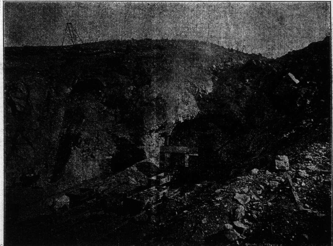
STEAM "HOVEL AT WORK IN KNOB HELL MINE, PHOENIX-Loose Rock Cleared away from mouth of tunnel