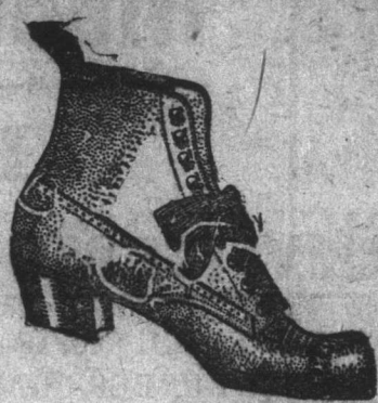
MEN'S BLACK SOFT KID LACED BOOTS for

$4.75, $5.00, $5.50, $6.00, $6.50, $7.00, $7.50.