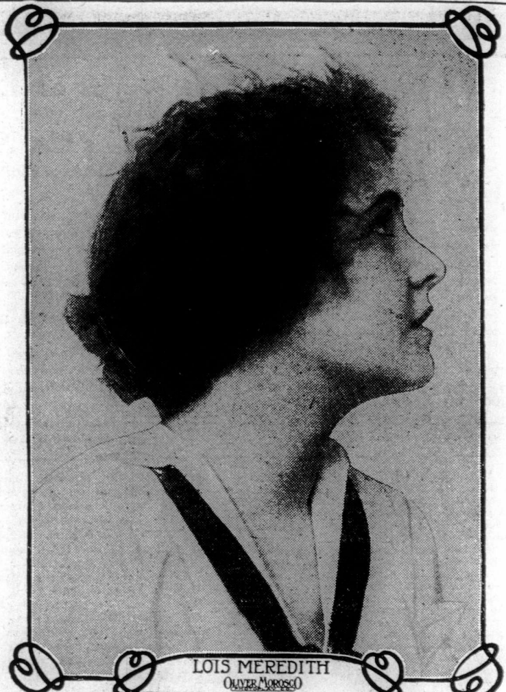
At the Allen in "Help Wanted," Monday and Tuesday.

In "Help Wanted" the dramatist plunged into the waiting heap to the very elbow and pulled out a handful, to use the argot probably affected in the offices of Scott & Son, the principal scene of the play. On the opening nights in both New York and Chicago the audiences fairly gasped at the uncanny reality of the characters that walked across the stage before them; gasped with wonderment at the sledgehammer significance of the words they spoke. It was something "new," something never given to them before; something taken from right beside them and held up to their faces to see. At last the American business office, an institution as peculiar to this country as the cotton gin or the McCormick binder, has been "done." In the motion picture production of this noted play by the