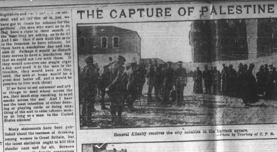
General Allenby receives the city notables in the barrack square.

SUCH SUFFERING CAN BE RESTORED BY BUILDING UP THE BLOOD.