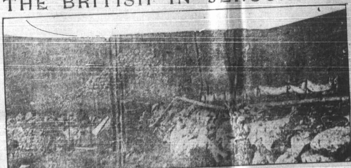
The Spring at Solomon's Pool.