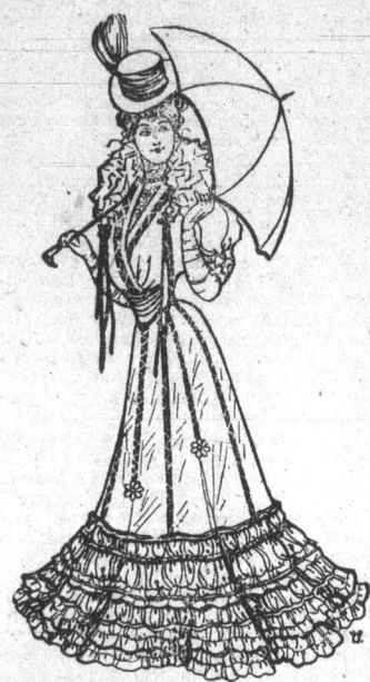
DEMITOTE IN CHIFFON.

In the second appears a gown of soft gray taffeta, the stylish long basqued coat intersected with silk em-