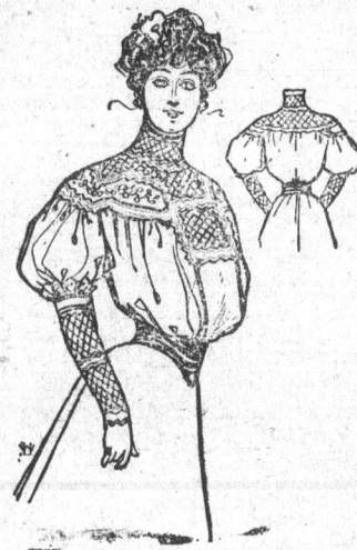
WHITE SATIN WAIST.

Vogue sketches and describes the very pretty white satin waist here shown. Fine white net and satin embroidered in a heavy cord edge of scal-