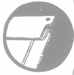
The Preston top-lock—where the big strain comes on a metal shingle—is worth knowing about. Ask.

Just a post card from you will bring it.