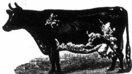
Breeders of high-class Ayrshires, choice Berkshires, and Shropshire Sheep. Young stock always for sale, at reasonable prices. Our Ayrshire herd is the largest and oldest in Canada. Write for prices. Parties met at Queen's Hotel, Carleton. 20-y-o