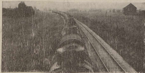
Tank Cars Carrying Imperial Asphalts

"Our Road Engineers and Experts will be glad to advise or assist you in all matters of road construction and paving. Their services are free."