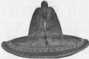
Design No. 1007.

Very Neat and Artistic For Man and Beast.