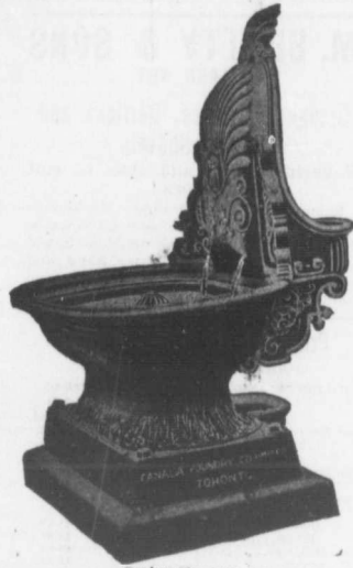
Design No. 1010.

Very Neat and Artistic For Man and Beast.