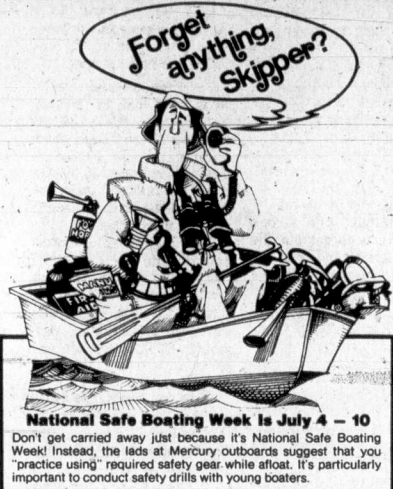
National Safe Boating Week is July 4 - 10 Don't get carried away just because it's National Safe Boating Week! Instead, the lads at Mercury outboards suggest that you "practice using" required safety gear while afloat. It's particularly important to conduct safety drills with young boaters.

• Maintenance of equipment is a must for all boat owners. Holes in hulls and motors that fail can cause swamping. A little bit of care and a lot of caution, by maintaining equipment regularly, will prevent the problem.