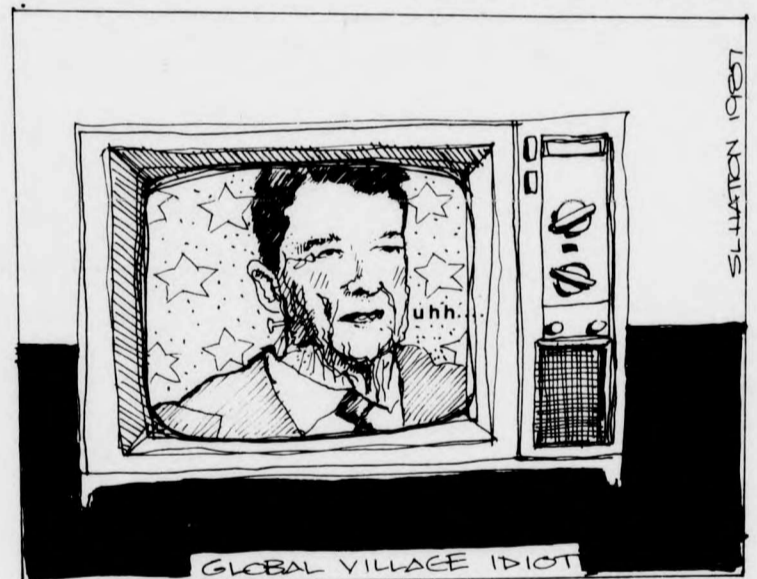
Not as Good as Pete's

As the Good Doctor greeted his colleagues, Elmo realized that though his prism display was impressive, it lacked the brilliant use of various waters as filters used in earlier experiments.