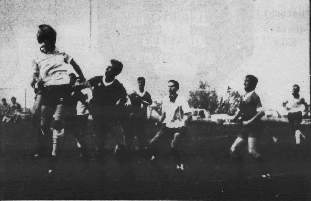
The Shirts Outclassed All Opposition Except SMU