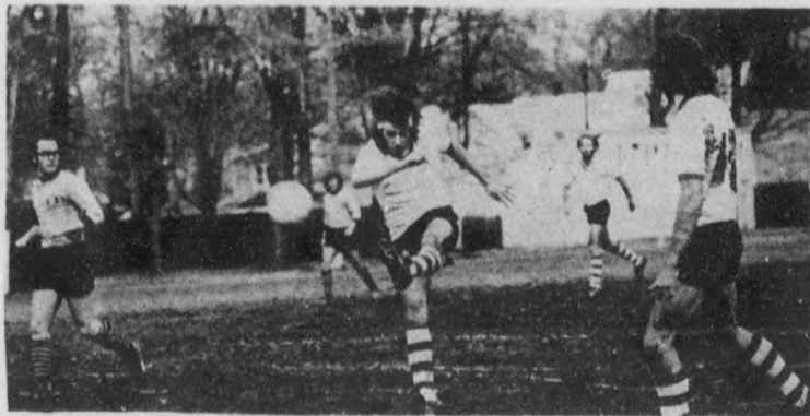
The Red Shirts play their first home game on September 11 at 11 a.m. against Presque Isle at College Field.