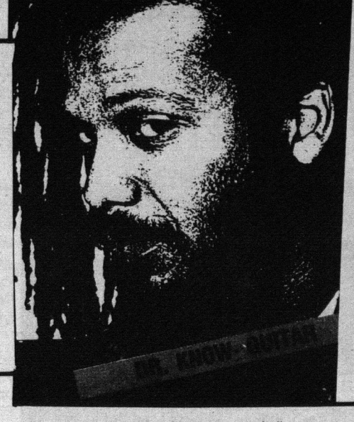
of this album like "Let Me Help" contrast violently to the almost pop-ish guitar reggae of the next song "She's Calling You". The lead singer, who goes by the monicker "H.R." does not have a very melodic voice, but it is smooth and integrates well with the

The fervent energy on the metal portions