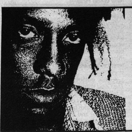
Bad Brains attempt fusion of styles

There is a lot of talent here, the music itself is very crisp, and the recording and production help it. This is an amazingly well mixed recording considering these guys call them-