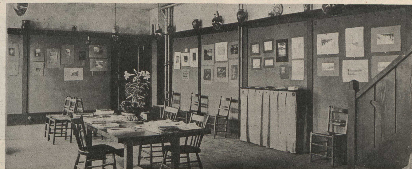
A General View of the 1909 Salon of Toronto Camera Club.