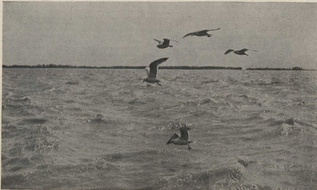
No. 11—The Gulls, by Fred Baird, Toronto.