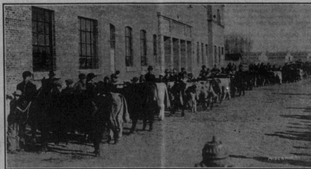
The calves at the Edmonton Spring Live Stock Show of 1919 lined up outside the pavilion to be judged. Each calf is exhibited personally by the boy or girl who has fed and fitted the animal from January 1 until the time of the Spring Show. The Children's Calf Feeding Competition is one of the most popular features of the show, and furnishes much real comedy as well.