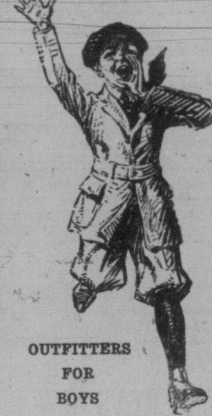
OUTFITTERS FOR BOYS

It's the quality of a Suit that makes it expensive or inexpensive—never the price. If the quality is there, service and satisfaction are assured. One cannot be too careful in the selection of clothes this season. They should be chosen where quality comes, before price, but where price is as consistently moderate as the standard will permit.