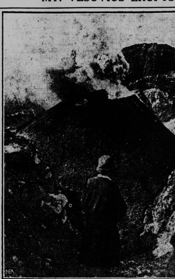
Mt. Vesuvius, Italy's active volcano, is now entertaining tourists by belching smoke, gasses and flames.